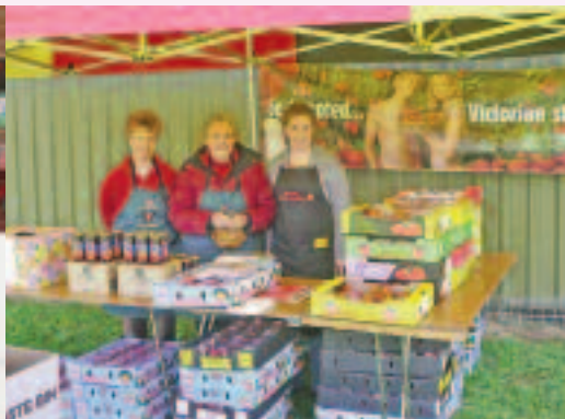
Volunteers at the strawberry sales stand kindly donated strawberries