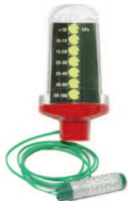
G-Dot soil moisture monitor