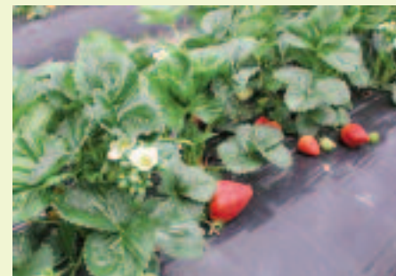
New strawberry variety 'Juliette' bred by Bruce Morrison through the Victorian strawberry breeding program

A variety yet to be named from this year's program will be commercialised, as it is also showing great potential.