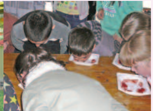
Strawberry eating competition